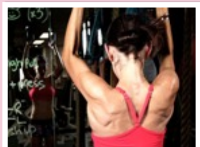
HOOP CHIN UP