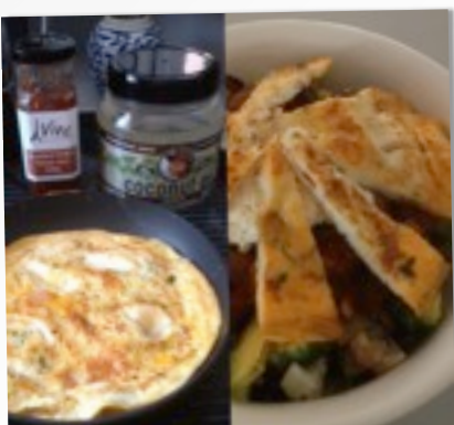
FEEDING FREQUENCY 4 – 6

meals so amp up the volume with your fibrous veggies. Veggies have a low caloric density (you can eat lots for few calories) and are also fibre rich which will keep you feeling fuller longer. Aim for a rainbow of colours as the micronutrients this will give you actually fight cravings.