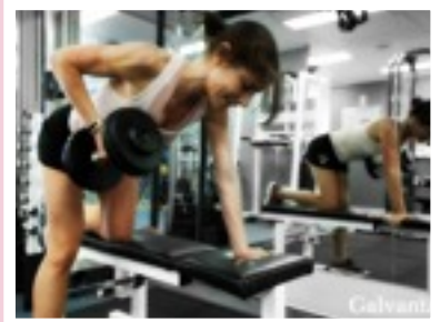
ONE ARM DB ROW