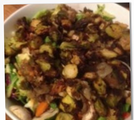
DOUBLE FIBROUS VEGGIES.