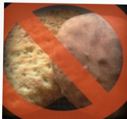
AVOID REFINED/SIMPLE CARBS