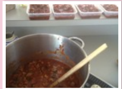
MEALS ON MASS

Mindset is the magic that will guarantee your success. You won't 'get' or won't 'get to keep' THAT BODY if you don't first lock and load the thoughts and beliefs that will support your ongoing fat loss success. Where to start? My 30 Day Body Transformation: